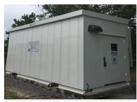
Custom Power Control Buildings