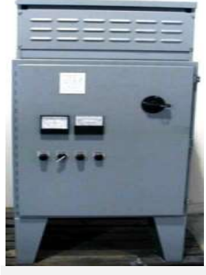
Neutral Ground Resistors