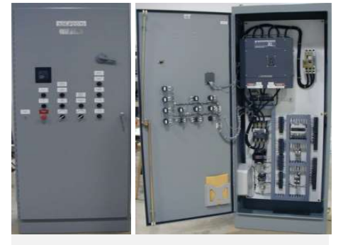
Electronic Starter Panels