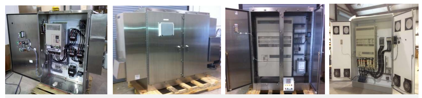
Customer Specified Variable Frequency Drive Packages